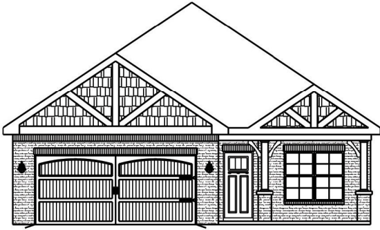
FRONT ELEVATION -A