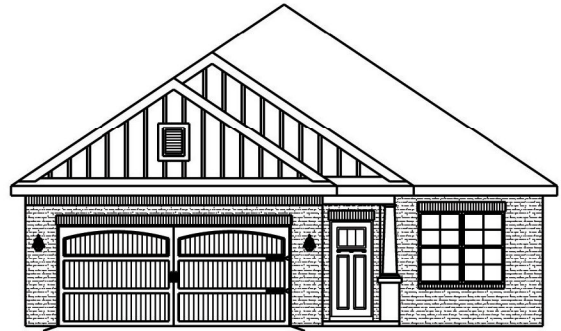
FRONT ELEVATION -B